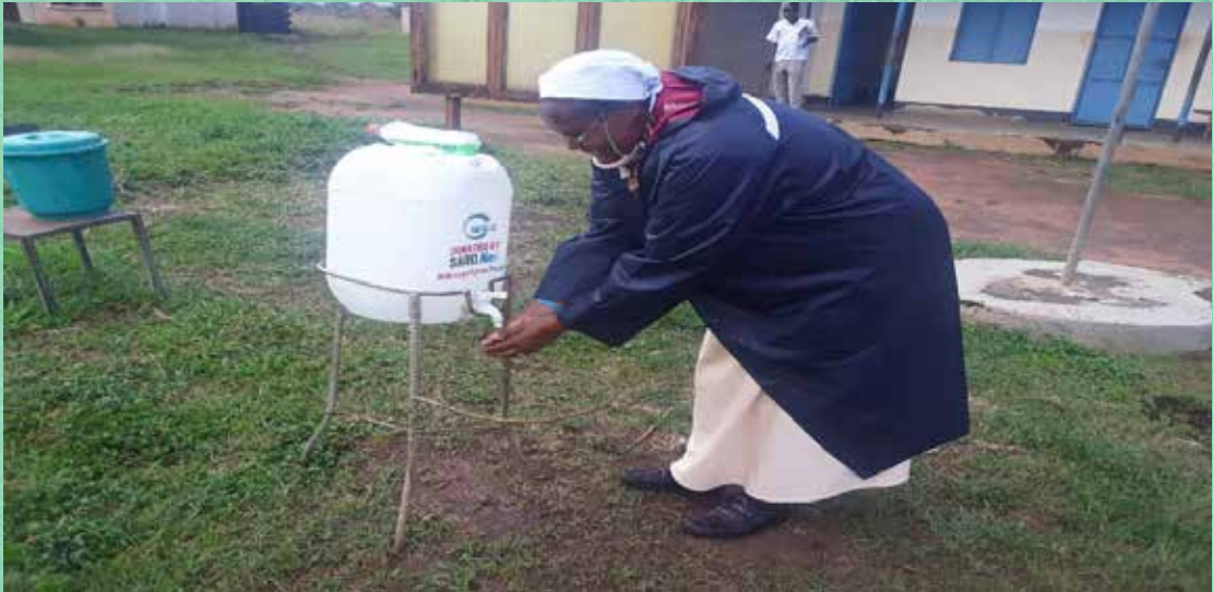
Figure 2: A hand washing kit given by SARD-Net to Paloga health centre III, Paloga Sub County, Lamwo District, Uganda.