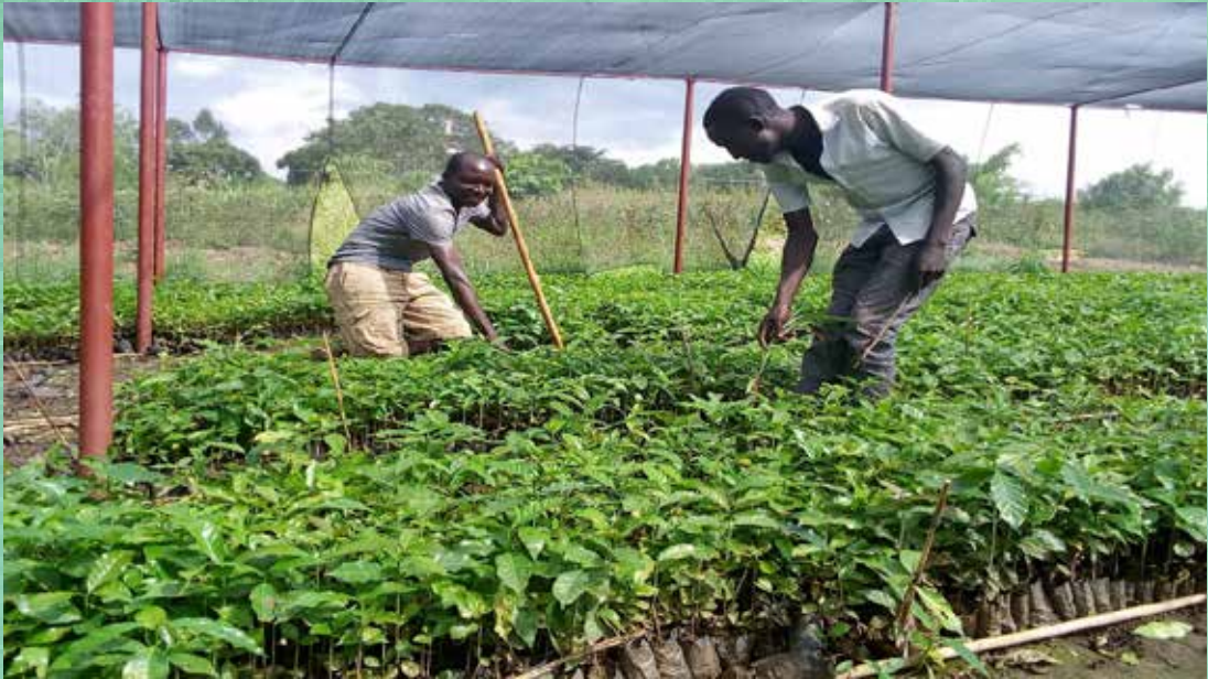
Figure 3: A community nursery supported by SARD-Net in Nebbi District, Uganda.